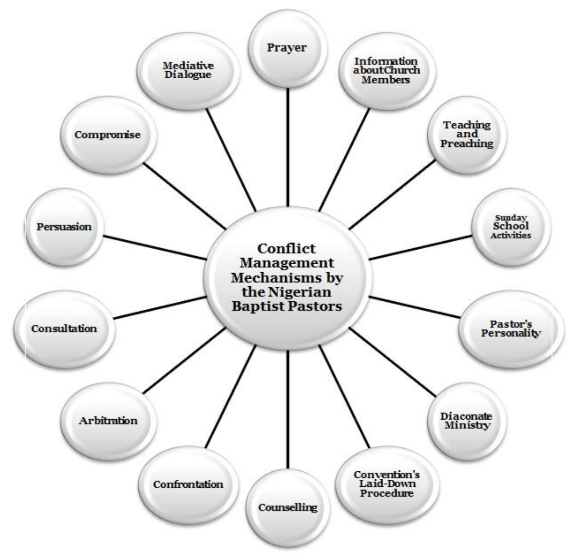
Figure 2: Conflict Management Mechanisms by the Nigerian Baptist Pastors Source: Researcher's Construct 2021