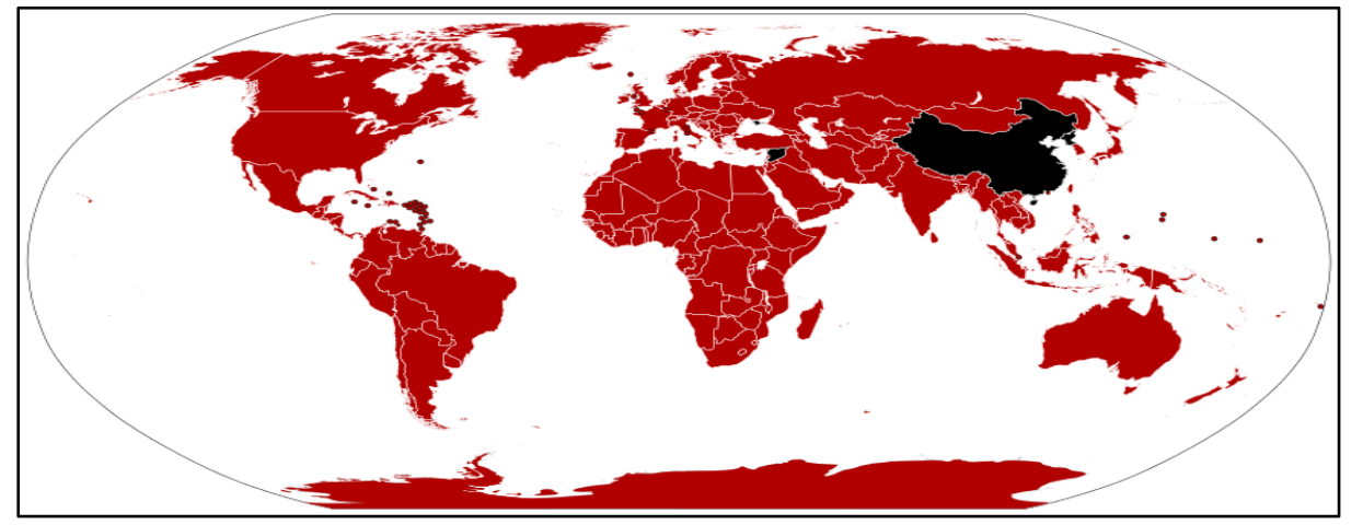
Figure: Countries where Netflix was available in Jan, 2016. China also has Netflix now (with Baidu, 2017);

As a result, they launched an offline playback feature, allowing users of the Netflix mobile apps on Android or iOS to cache content on their devices in standard or high quality for viewing without an internet connection, in Nov, 2016. However, they have taken care to start with availability of this feature just in selected series and films, and they shall go on increasing the scope based on the customer response and their own technical build-up. (Chicago Tribune, 30 Nov 2011, "Netflix unveils download feature for offline binge-watching" [17]).