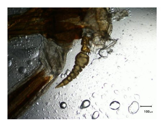
Plate 4: Sample Sh-T38 antenna: Type IV Pangonia (Philoliche) spp.