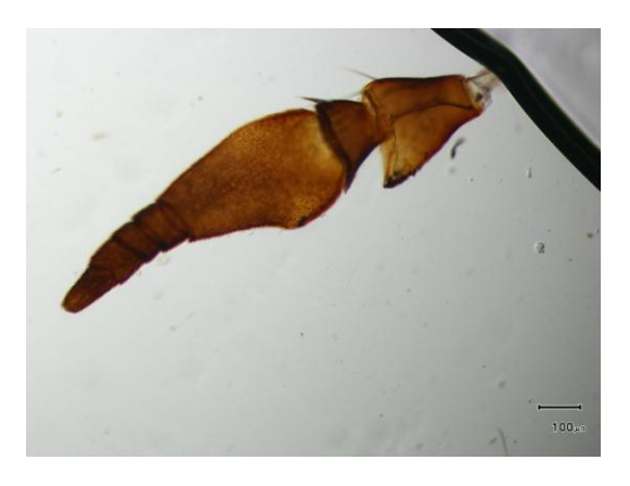
Plate 3: Sample Sh-T40 antenna: Type III