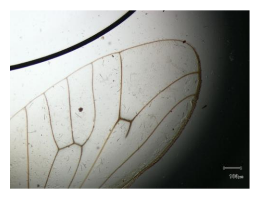
Plate 10: Sample Sh-T44 Wing: Type III Big R4 appendix