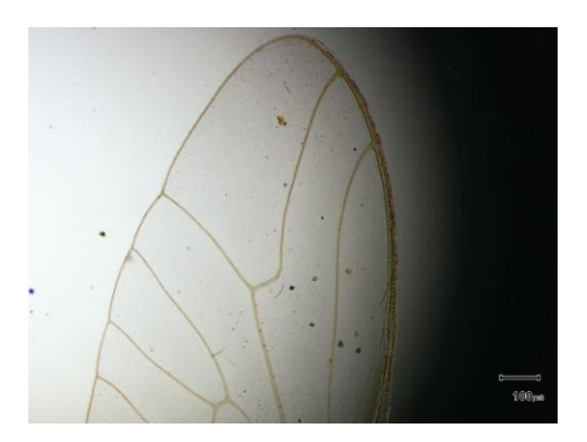
Plate 9: Sample Sh-T37 Wing: Type II

Fused R2 & R3 (PC1, PC2 & PC3; R4 without appendix)