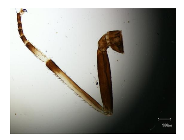
Plate 6: Sample Sh-T44 Hind tibia