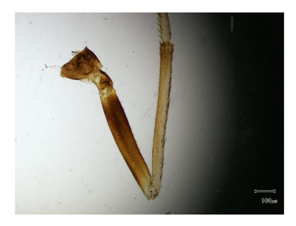
Plate 7: Sample Sh-T37 Hind tibia