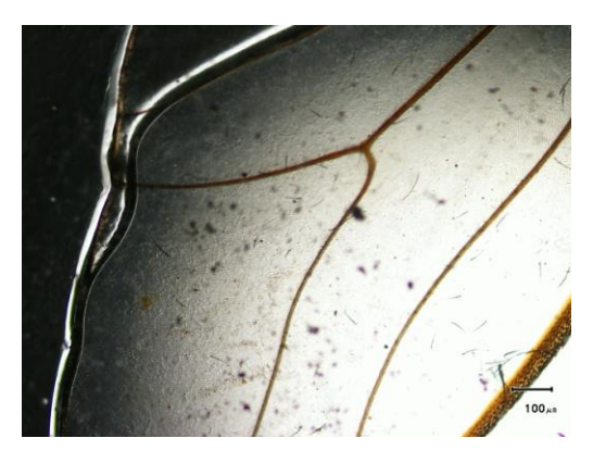
Plate 8: Sample Sh-T13 Wing: Type I