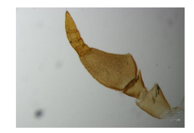
Plate 2: Sample Sh-T46 antenna: Type II