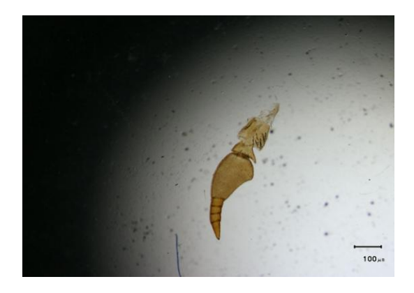
Plate 1: Sample Sh-T17 antenna: Type I